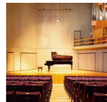
Hansen Memorial Hall