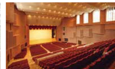
Main Auditorium (Hall)