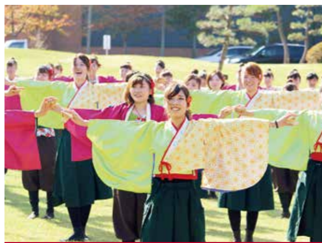
Yosakoi dance circle