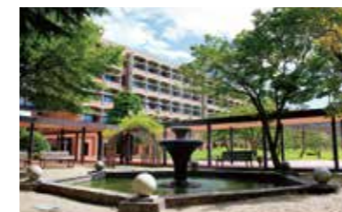
Founders' Memorial Garden