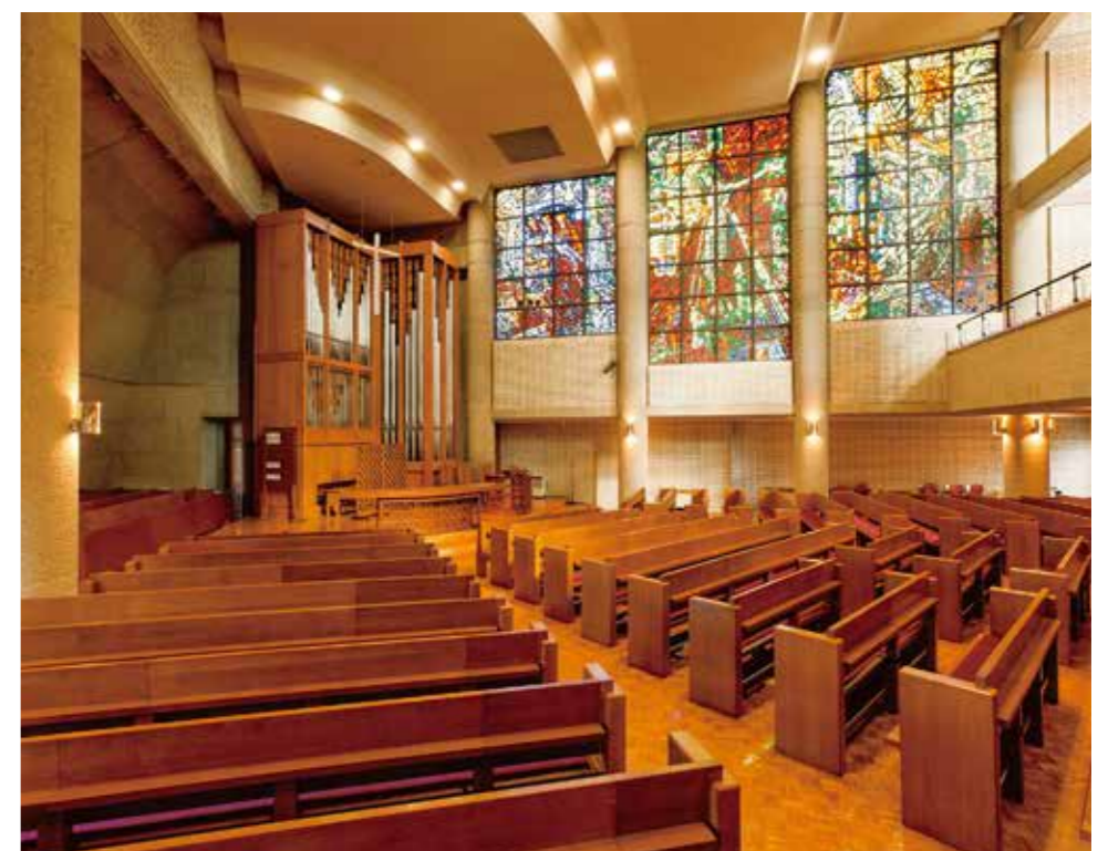
Interior of chapel (with organ and stained glass windows)