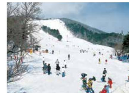
Izumigatake Ski Ground