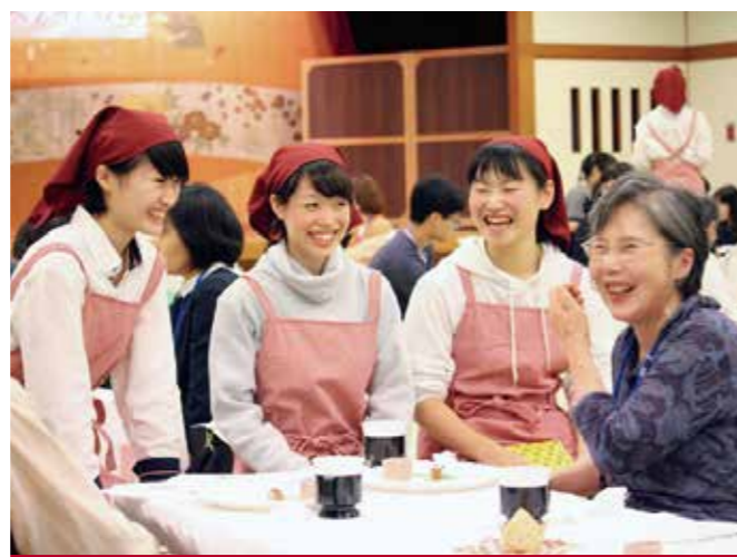
Community support project