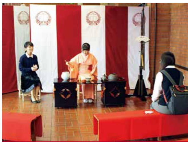
Tea ceremony circle

MGU also has a Liaison Action Center (MG-LAC) to promote, coordinate and provide appropriate support for student volunteers. MGU was first amongst the universities in Sendai to set up such an office after the tsunami and earthquake of March, 2011. MG-LAC provides interested students with the opportunity to identify problems in the society around them, and to discover productive ways of helping other people find solutions to these problems. University faculty and staff provide advice and guidance as needed. MG-LAC plays an important role in the university's commitment to training students who can play an active and leading role in helping build local society.