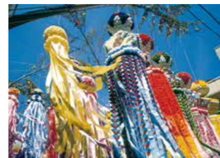
Sendai Tanabata Festival (August)