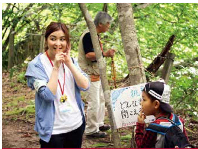
MG-LAC children's summer school