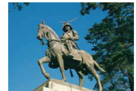
Date Masamune the founder of the City of Sendai