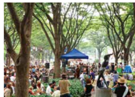
Jozenji Street Jazz Festival (September)