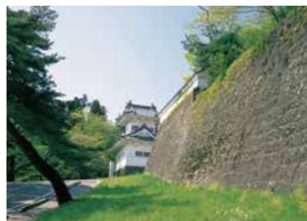
Sendai Castle Site