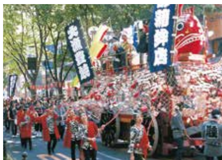
Sendai Aoba Festival (May)

For further information about the city, please visit the Sendai Official Tourism Website. ( www.sendai-travel.jp )